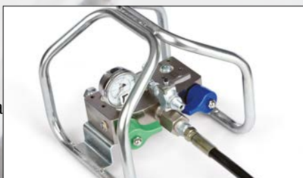
Remote Mix Manifold

Material mixing reaches a new level of precision due to new dosing technology. With the Graco XM, the minor component (or side B material) is injected at high pressure into the major material (side A). Advanced sensors allow pumps to compensate for pressure fluctuations, resulting in accurate, on-ratio mixing for better yield and less waste.