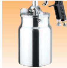
Suction cup pt. no. KR-566-1-B

GTi HD spray guns are packaged as pressure gun only, suction gun kit includes 1 litre cup and gravity kits include the 568 ml standard gravity cup.