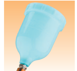
Gravity cup (Blue polyester) pt. no. GFC-511 for difficult fluids.