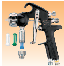
Optional accessory VSA-512 St/St Fluid Filter Kit (inc. 3 elements)