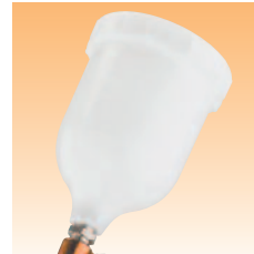
Gravity cup pt. no. GFC-501