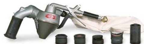
Picture above shows optional vacuum heads

Our Spot Blasting Tools are ideal for cleaning of small areas. The Eductomatic is our smallest closed-circuit tool, weighing around 3 kg.